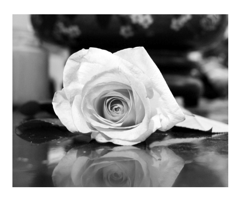
Please join us to Remember the lives lost or injured in the workplace

Starts at 10:45 a.m., Ceremony at 11:00 a.m. At Marine Peace Park