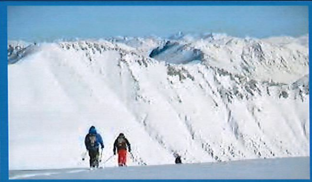
Winter in Gold Bridge