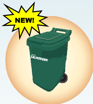
WEEKLY FOOD WASTE COLLECTION