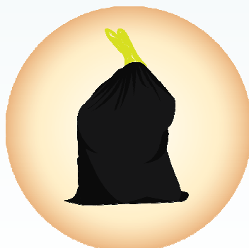
BI-WEEKLY GARBAGE COLLECTION